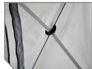
VELCRO TIES TO SECURE TENT POLES