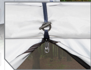
ZIPPER HOOKS TO KEEP FLAPS OPEN

Experience the ultimate camping freedom with the Overland Vehicle Systems Safari Tent. Engineered for speed and convenience, our innovative aluminum folding frame ensures effortless setup and packing in just 30 seconds. Crafted from waterproof 420D Oxford material, and featuring a waterproof PVC floor, this tent offers unbeatable protection from the elements. With its spacious attached awning, you'll have extra room to relax and customize your outdoor space. Stay comfortably ventilated with large windows featuring breathable screens to keep the bugs out. Elevate your camping adventures with the Overland Vehicle Systems Safari Tent where quick, lightweight, and easy meet the great outdoors.