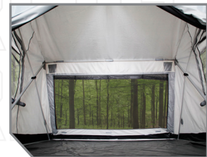
LARGE INDOOR AREA